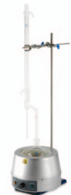
Typical Dean & Stark Assembly