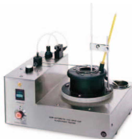
13230-3 (Thermometers supplied separately)